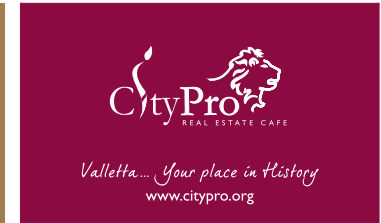
Business Card Design; 300gsm, 50x90mm, Matt Lamination