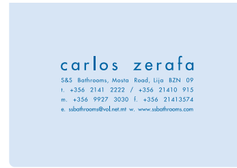
Business card design; 300gsm, 50x90mm, gloss laminated