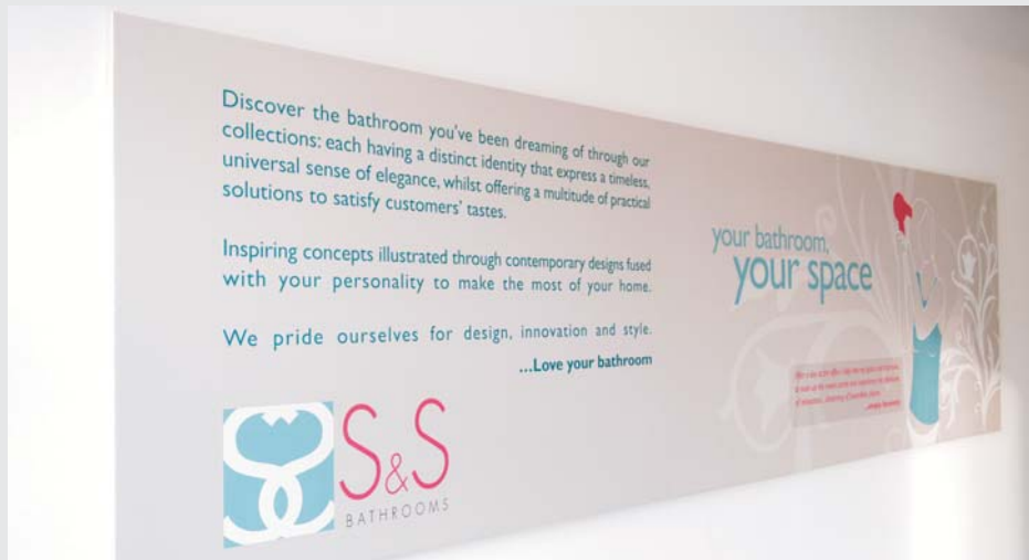
Welcome panel 4x 1.2m for main brand