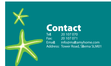
Business card design; 45x90mm, 300gsm