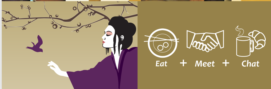
Interior Graphic 900x600mm vinyl on perspex