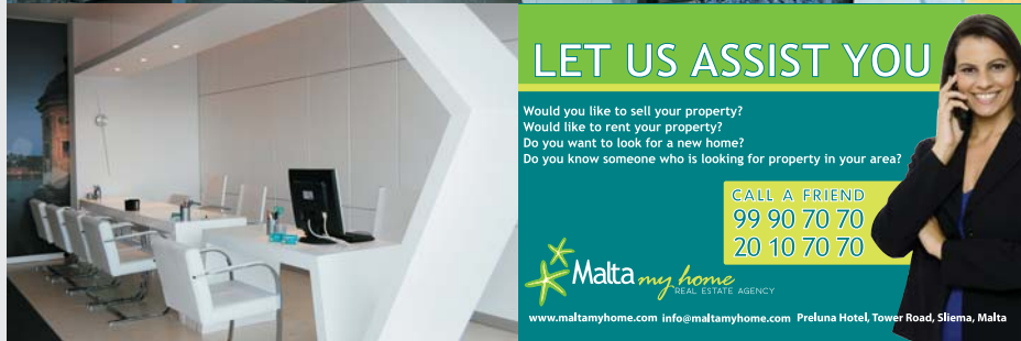
Interior Design & Graphic