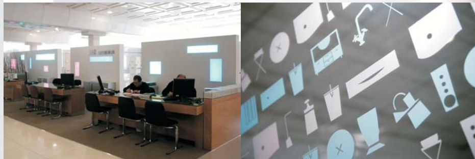
Interior Design & Signage