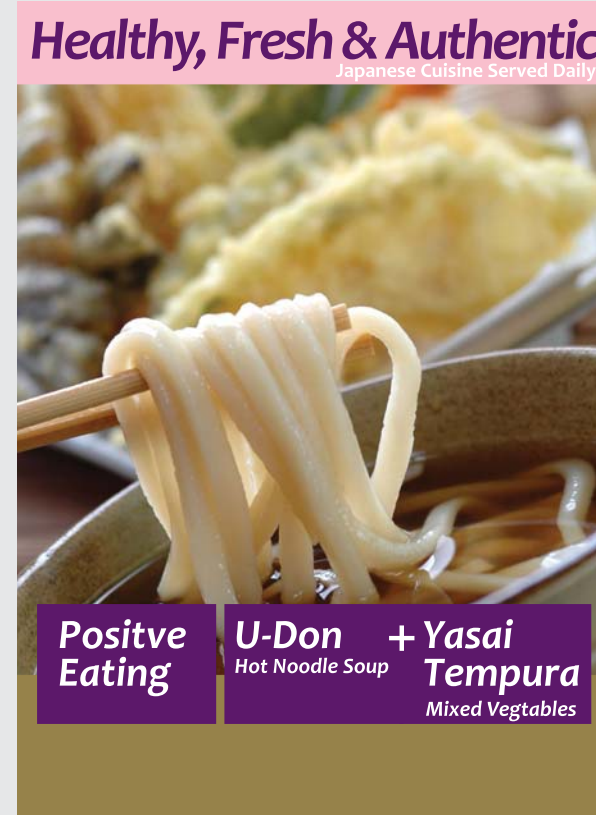
Poster Design, 960x1380mm