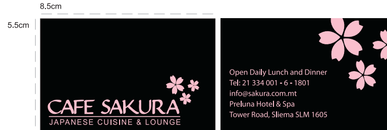
Business Card Design; 300gsm, Matt Lamination, 55x85mm