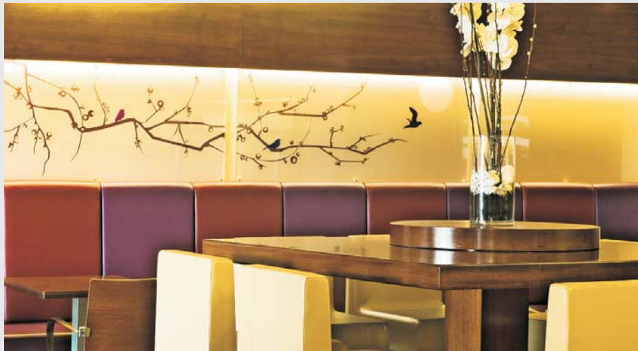
Interior Design & Graphics vinyl on perspex